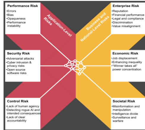
Figure 1: PwC Taxonomy of AI Risks

Some of the new or expanded set of risks of AI applications (Figure 1) that organizations need to address are localized to individual applications, like those of bias and discrimination or lack of interpretability. Other risks are much more societal and global, reflecting the potential for systemic discrimination, exacerbation of inequalities and job displacement, and broader ethical risks, like surveillance. The breadth of these risks highlights the need for additional governance, including risk identification, oversight, and controls within organizations adopting these complex systems.